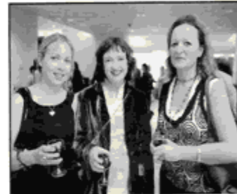
CELEBRATING THE LAUNCH OF STILL STANDING IN GALWAY CITY MUSEUM, 13TH JUNE 2007