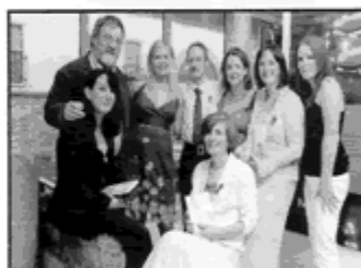
AIDS WEST TEAM CELEBRATING THE LAUNCH OF STILL STANDING ON 13TH JUNE 2007

AIDS West would like to thank the Naugatuck Chamber Choir very much for the wonderful performance in St. Nicholas' Collegiate Church, Galway on Thursday 22nd February. The choir, which hails from the Naugatuck High School, Connecticut, USA has been widely recognised for its outstanding contribution to the arts in Connecticut and has performed extensively in North America and Europe. Their very wide programme included a cappella choral music including themes based on Gregorian Chants and choral work by famous composers. This choir clearly demonstrated that the human voice is the most perfect instrument on earth. We thank them most sincerely for their generous performance, which raised €182 for our organisation.