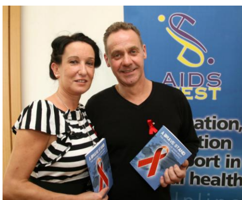
Friends of AIDS West at launch of the "History"