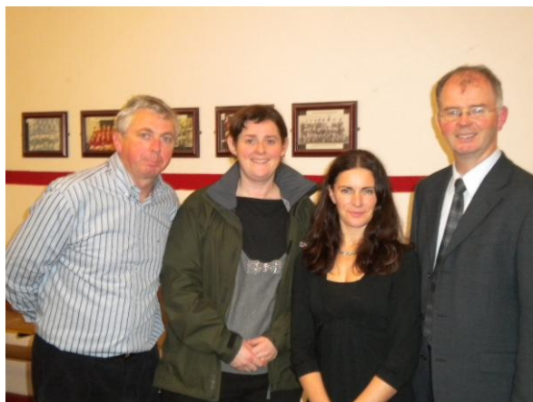
Parenting nights at St Colmans, Claremorris