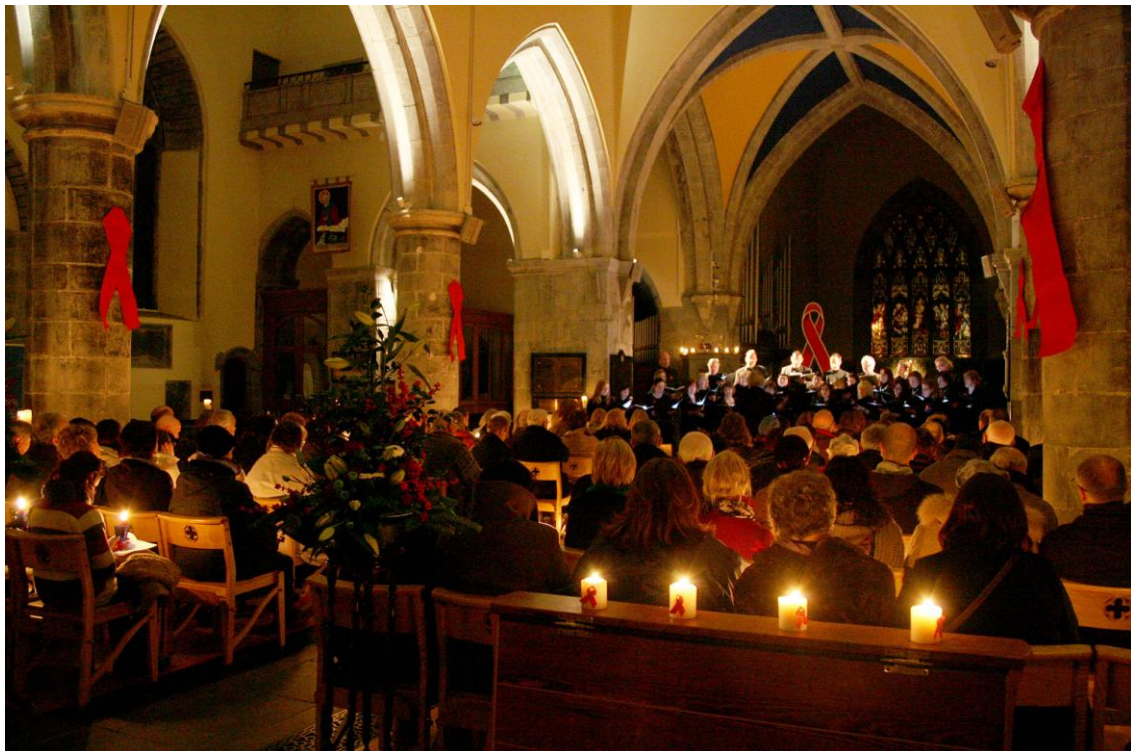
St Nicolas' Collegiate Church in its glory on World AIDS Day, December 2010