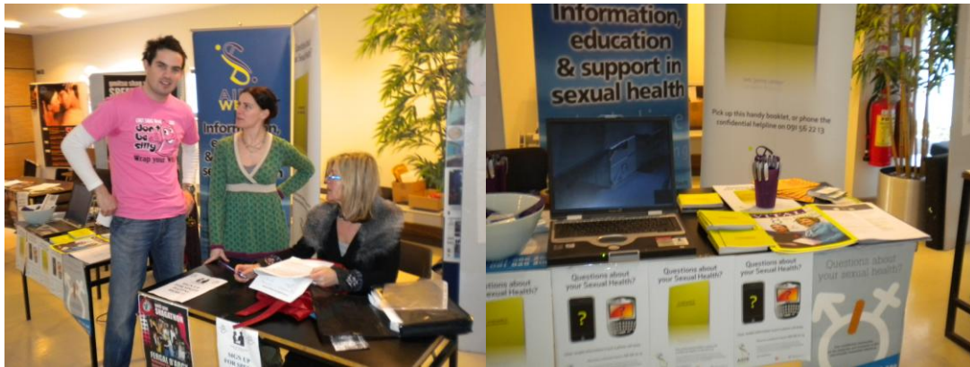
AIDS West stands at various events

Our major drive this year has been on expanding our educational efforts. While our focus has been on secondary schools we have also targeted 3 rd level institutions. We have held numerous workshops and attended many student fairs in NUI Galway, GMIT, Sligo IT and Athlone IT. We are constantly availing of opportunities to create awareness through local radio and the print media etc. We also have involvement with events such as a fun quiz night at the Stage Door with the LGBT (Lesbian, Gay ,Bi Sexual ,Trans-sexual) group