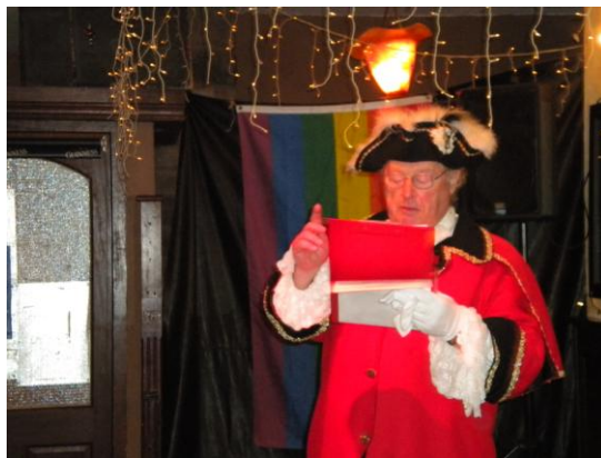
Fun Quiz night at Stage door