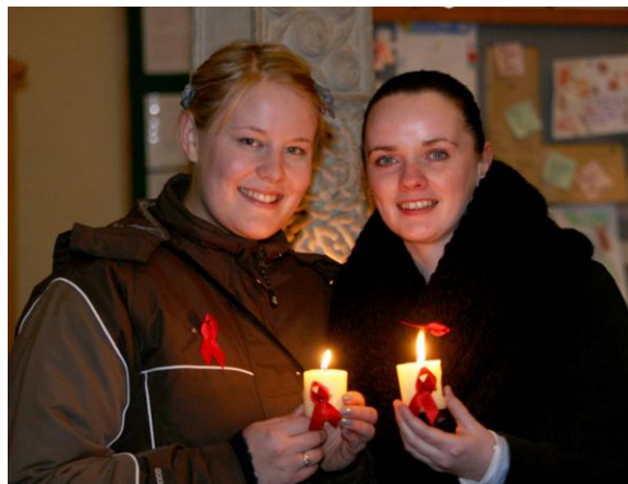
Board members with Mayor of Galway (top), Volunteers lighting the candles (bottom)