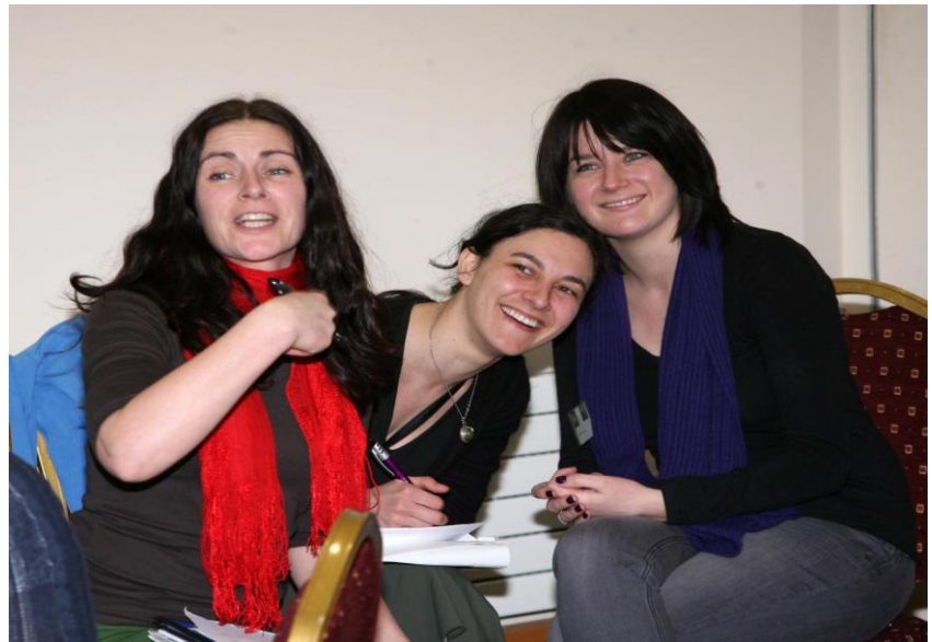
Both lecturers and attendees get into the swing of things at the THT course “Understanding HIV”