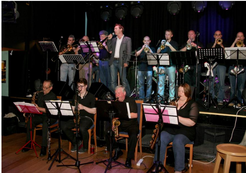
The Black Magic Big band in action on the night in Monroe's