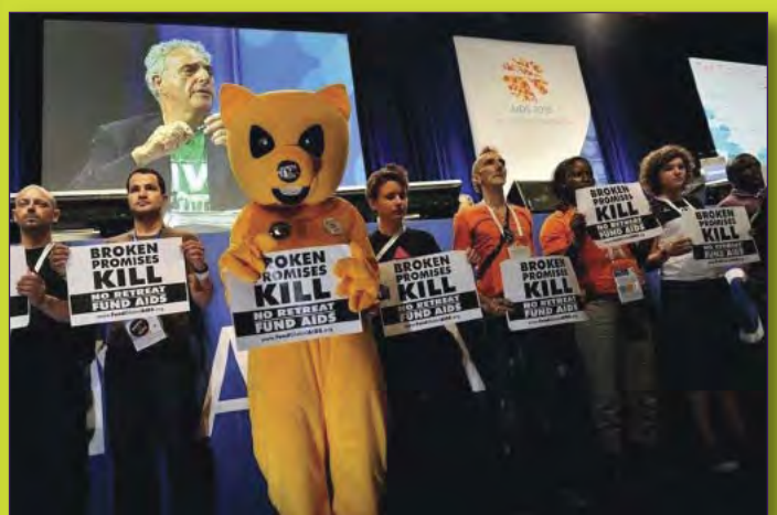
Demonstration at Conference.

This issue of Happiness is Vital is supported by