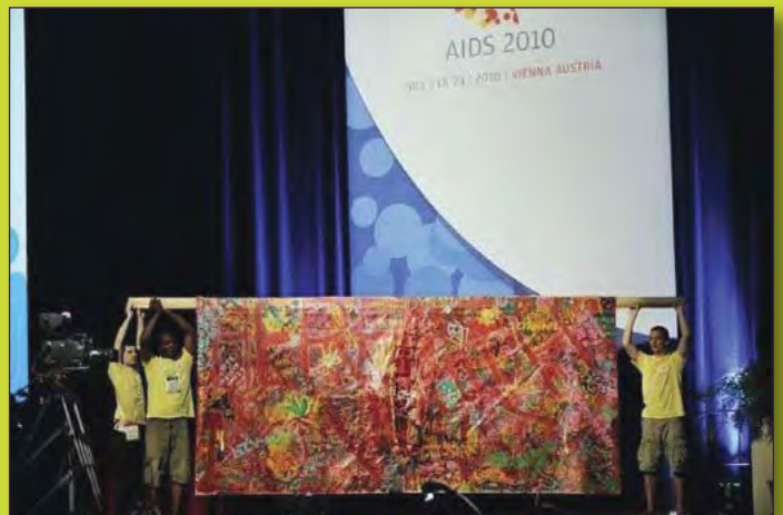
Painting created by delegates.