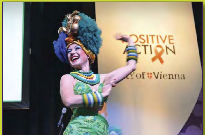
Opening Ceremony.