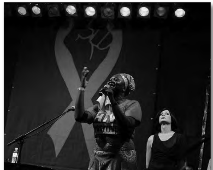
Human Rights March and Rally at HIV Conference in Vienna.

THE SEXUAL HEALTH EDUCATION and the Drugs & Alcohol co-ordinators at AIDS West have been combining forces over the summer and delivering Men's Health Awareness workshops in the direct provision hostels in Galway. Both were well received with all participants showing a great interest in the course material delivered. We are currently running a 5 week parenting workshop for members of the new communities which will finish this week with all those who attended receiving certificates for their participation. It has been very interesting for us, as facilitators, to gain an understanding of the many dilemmas parents face trying to raise their children in a culture so different from their own. As the summer draws to a close, we are gearing up for the schools to re-open and for us to re-start our Relationships & Sexuality Education Programme, so we would like to welcome back all students we've worked with in the past and to introduce ourselves to those we hope to work with in the coming school year.