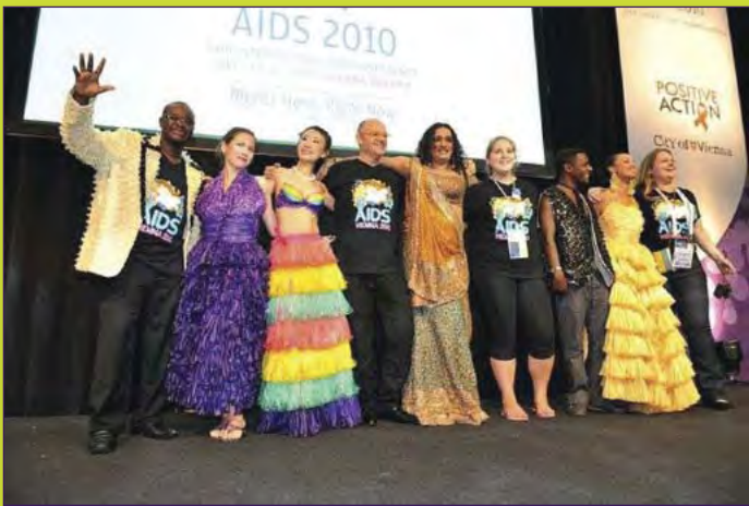
Global Village Opening Ceremony.