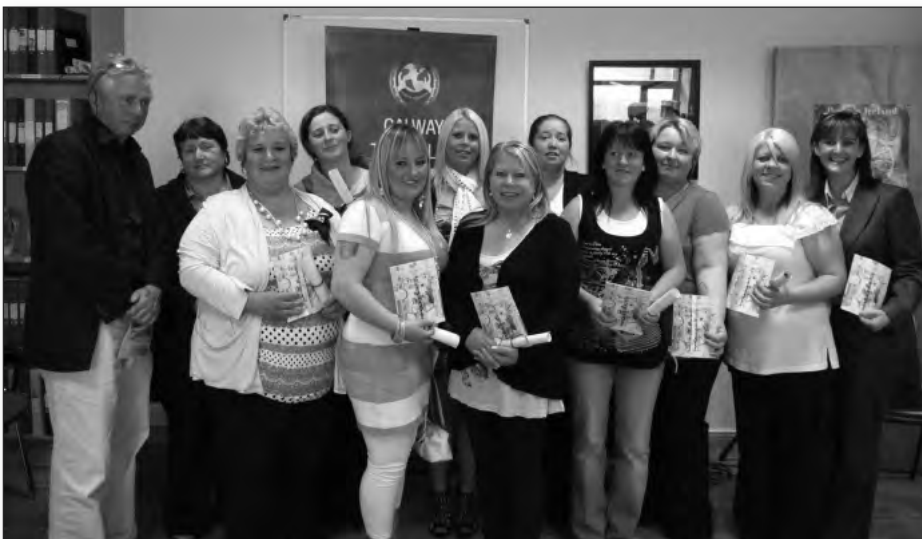
Launch of Your Life Your Choice

Alternatively you can visit www.nuigalway.ie/crols/participate.html