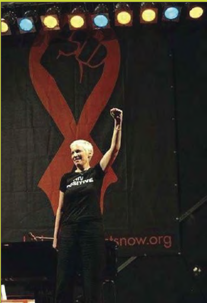
Annie Lennox at Human Rights Rally.