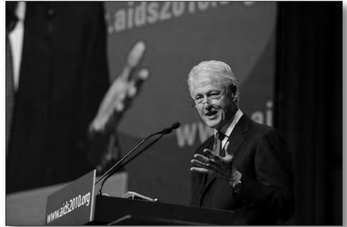
Former US President, Bill Clinton addresses the HIV Conference in Vienna.