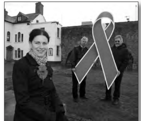
World Aids Day Launch